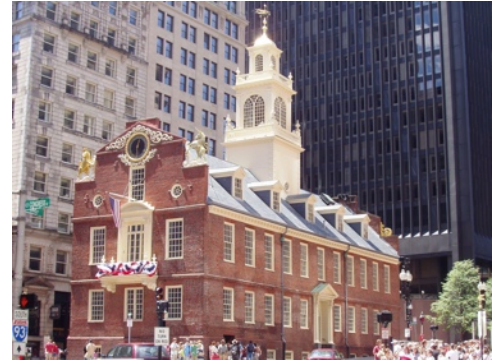
Old State House