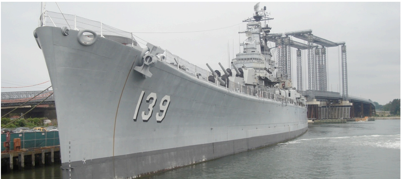
USS Salem can be toured less than 4 miles from reunion hotel. More on reunion pages 2, 7, 8.

One of the attractions to see during our Boston reunion