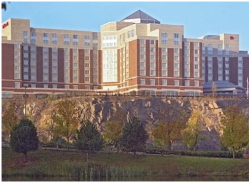
Boston Marriott Quincy